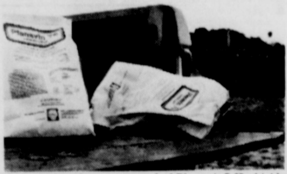
Growers bought every pound of Planavin® Herbicide they could get their hands on last season. Read why.