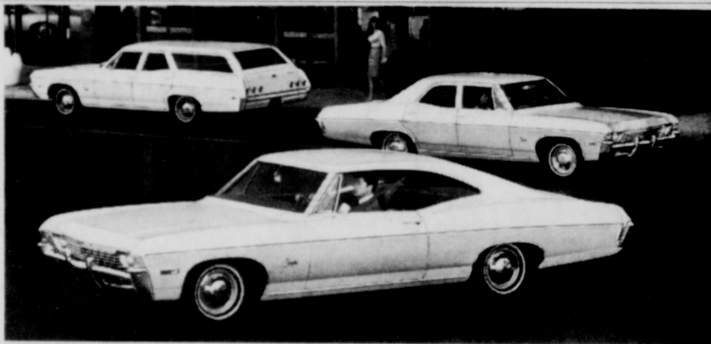
Impala Sport Coupe (foreground); 4-Door Sedan, Station Wagon