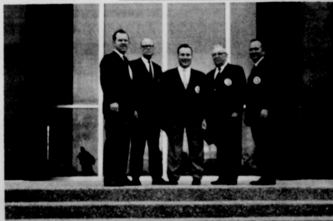
IN AUSTIN SESSIONS — These five Slaton men returned from Austin this week after visiting various state agencies to discuss industrial and economic growth factors. Pictured in