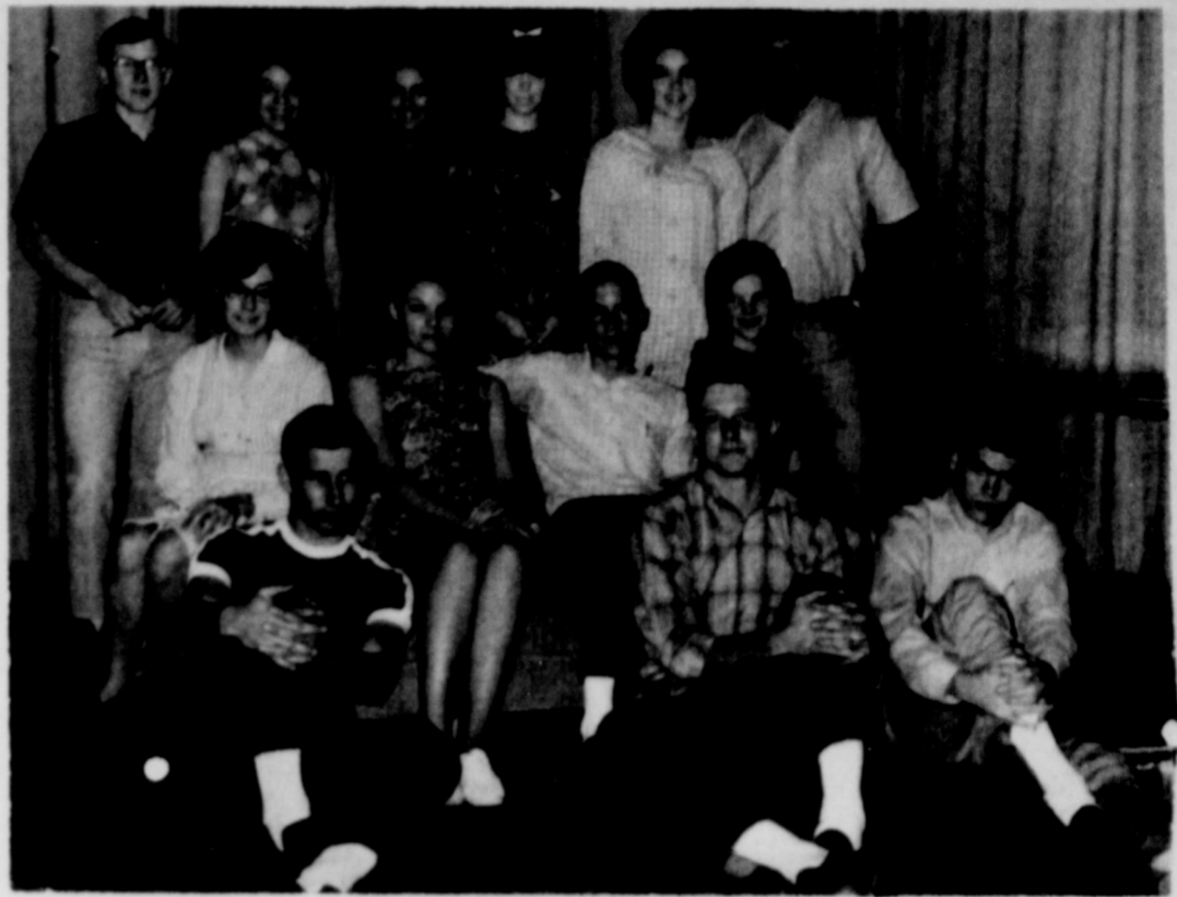
JUNIOR CLASS PLAY CAST---A three act comedy entitled "The Worm Shall Squirm" will be presented Tuesday at 8 p.m. at the Slaton High Auditorium. Pictured are members of the play cast.

The luncheon was in her home and 20 attended. A St. Patrick's Day theme was used for decorations.