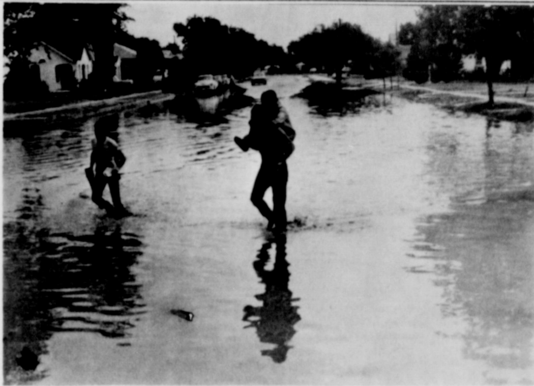
RAIN FLOODS CITY STREET — A thunderstorm dumped rains measuring from 1.5 inches to larger amounts in and around Slaton last Thursday. The downpour flooded some city streets—such as this scene on Dayton and S. 10th St. Rainfall amounts varied around Slaton, ranging from .40 of an inch to 3 inches.

Some dryland crops still need moisture in areas around Slaton, but in general the crop outlook is the best in years.