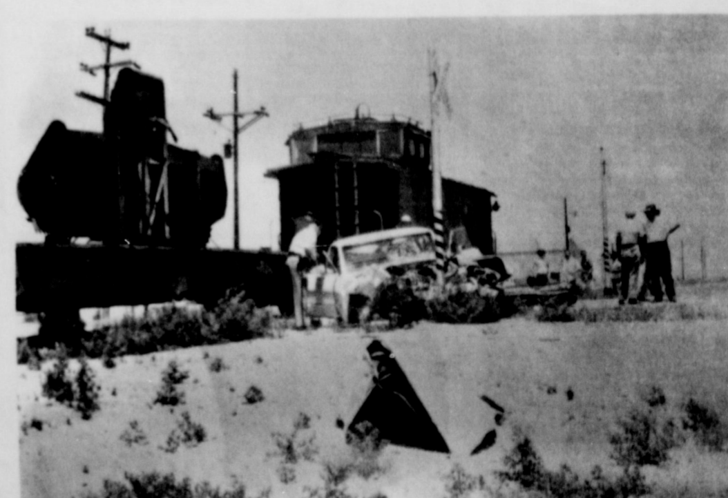
SCENE OF ACCIDENT — A Lubbock woman was killed and two of her children injured in a car-train crash one-half mile southeast of Slaton last Friday. The crumpled hood of the car can be seen in the foreground, while the progress of the car was halted by a railroad crossing sign.