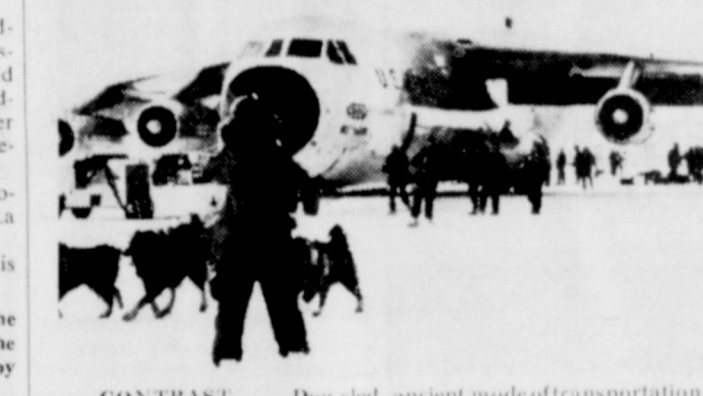
CONTRAST... Dog sled, ancient mode of transportation at the bottom of the world, is dwarfed by U. S. Air Force C-141 StarLifter at McMurdo Station. The plane was first to land on the ice in the Antarctic.