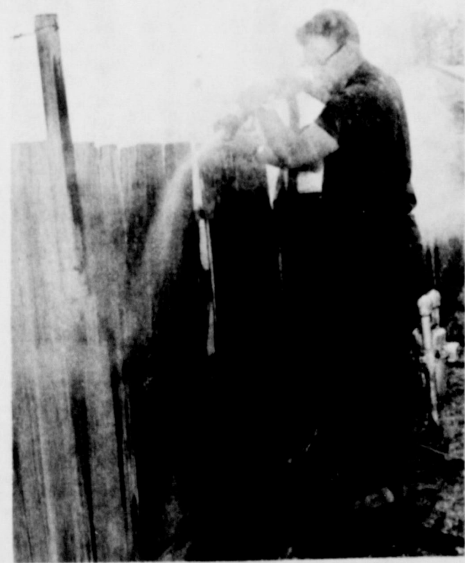
FIREMEN AT WORK--A fence fire at 700 S. 11th Saturday at noon brought Slaton's Volunteer Fire Department to the scene. The blaze was quickly extinguished by the firemen.