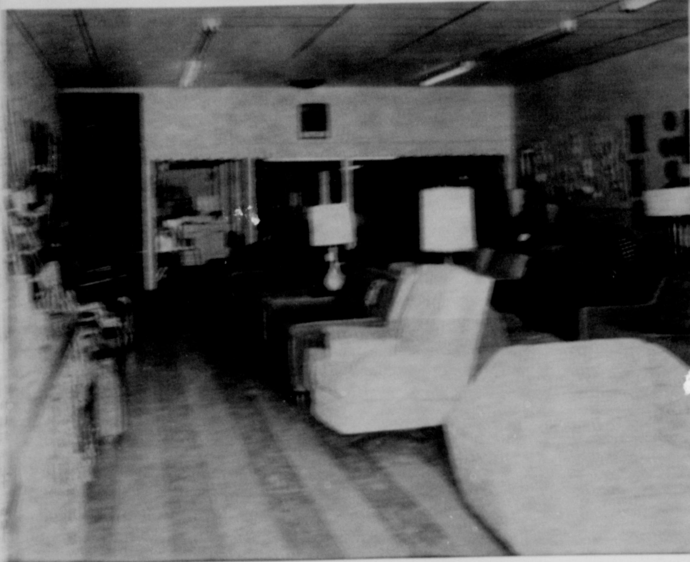
This Picture Was Taken Inside Of Our Store After Remodeling. You Can See Many More Displays In Our Large Store When You Visit With Us.