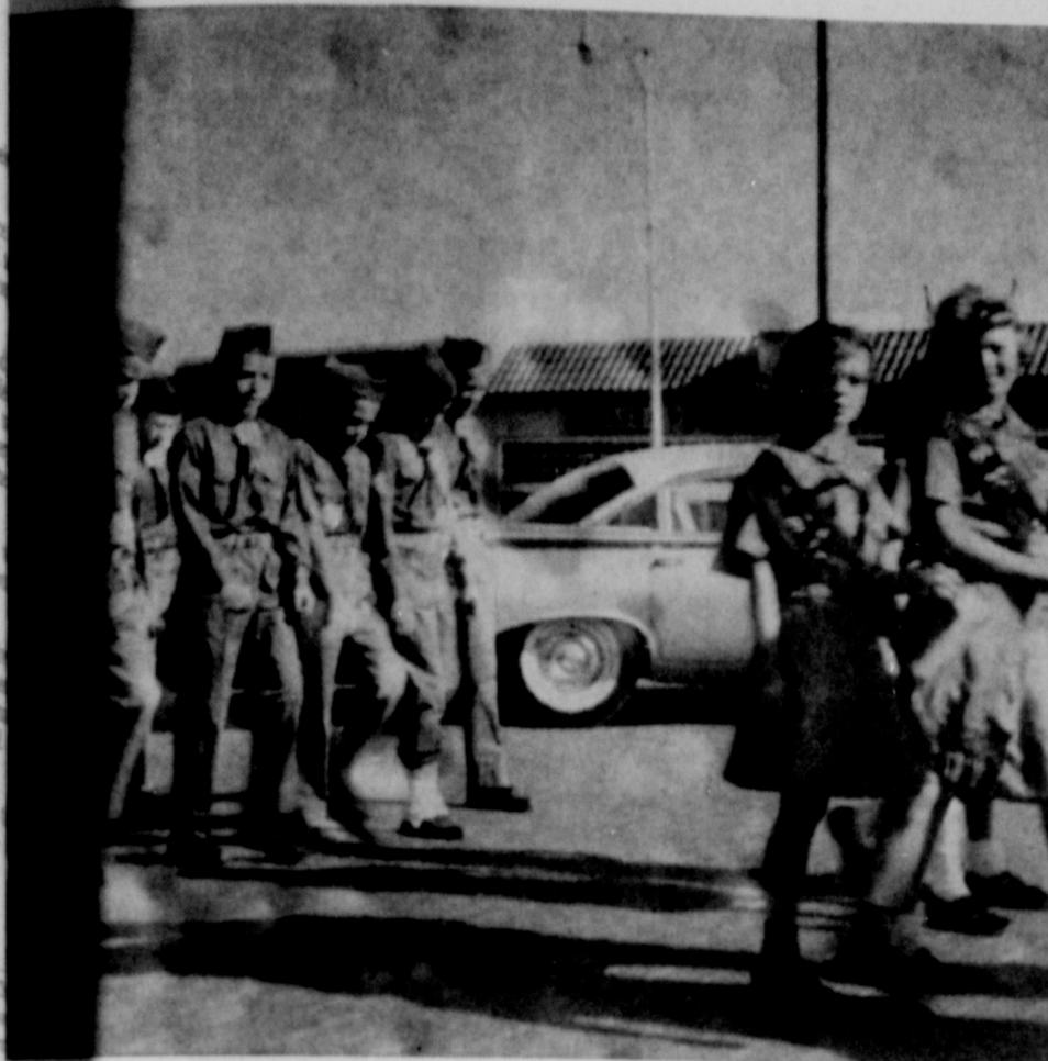
PARADE MARCHERS — Members of Slaton Girl Scouts and Boy organizations joined the parade Wednesday which formally opened the community-wide cleanup campaign. Both groups also have been active in assisting in the phases of the neighborhood beautification project.