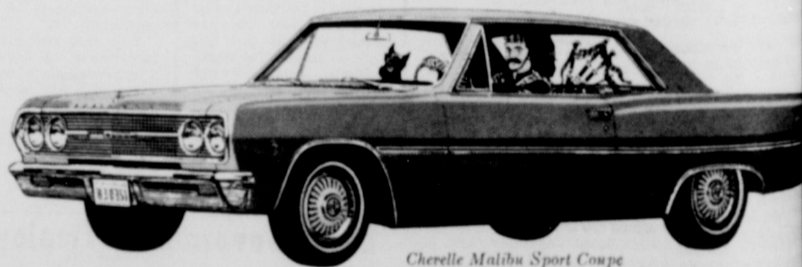
Chevelle Malibu Sport Coupe

No matter how you look at it, this car makes a lot of sense. If you're interested in value (and who isn't), the eleven features above give you a good idea why more intermediate-size car buyers are thinking Chevelle. If you're looking for a wide power choice, Chevelle starts out with a standard 120-hp Six, an ideal city performer. After that you may order from a variety of engines that turn it into an even greater highway performer. Room? Large door openings. Wide curved side windows for extra shoulder room. Great front and rear leg room. Those front six passengers have it made. And so do you. Chevelle may seat like a big car but it's like a smaller car. Comfort? Thick wall-to-wall carpeting. ibu models. Foam-cushioned seats. Easy instrument panel. The whole car looks like those in cars costing less. Come on down to our showroom. Take a drive soon. Chevelle makes even more sense after you've driven a couple of miles.