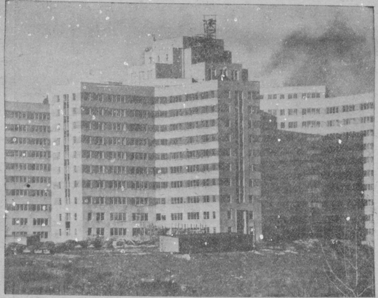
NEARING COMPLETION-The outer shell of the new Veterans' Administration Hospital, in Albany, N.Y., is almost finished. The 14-story building, of fireproof construction, will have a capacity of 1000 beds when it's ready for the first patients.