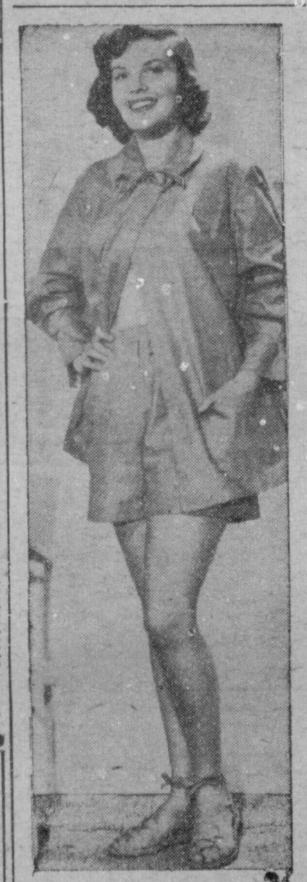
starlet Barbara Bates wears this three-piece blue denim play suit in Hollywood. It consists of bra, boxer shorts and full-sleeved jacket -just the thing for play time.

Lassen Volcano in north California is the only active volcano in the U.S.