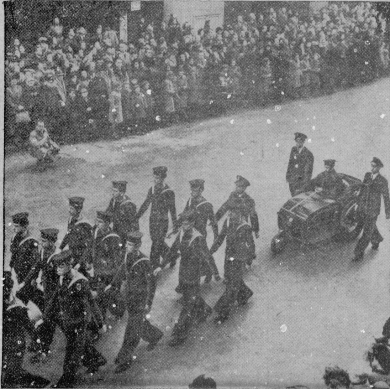
KEEPS UP WITH THEM —This wounded member of a British ship, the Amethyst, follows his buddies in a mechanical invalid chair as they march through the streets of London. The occasion followed a Thanksgiving service, on a different date than in the U. S.

Emperor Haile Selassie recently laid the cornerstone of Ethiopia's first YMCA in Addis Ababa during a ceremony on the 19th anniversary of his coronation.