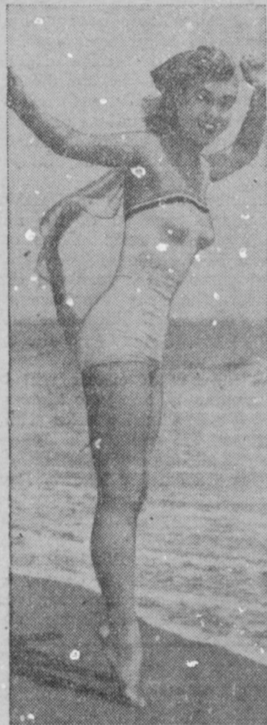
SPRITELY — Actress Vera-Ellen stays fit for the strenuous dancing in her movies by romping on the beach at Santa Monica, Calif. A well-planned program of relaxation helps her keep that famous figure.