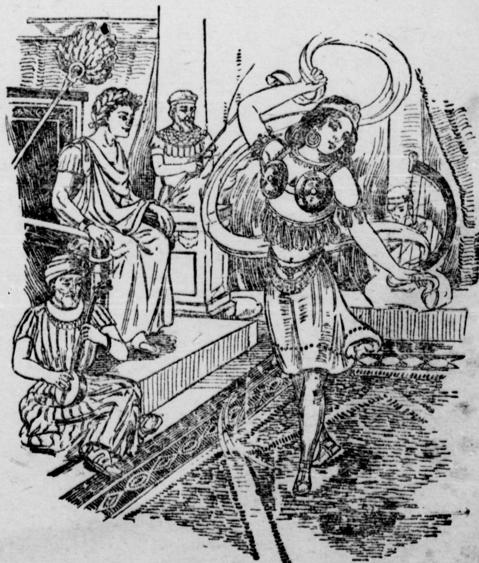
SALOME DANCING BEFORE KING HEROD.

K ING HEROD was so well pleased with the dancing of his daughter, Salome, that he offered her half his Kingdom and one of the saddest tragedies in Christendom followed, and his throne toppled and fell. The people of today are oftentimes so well pleased with the vaudeville performance of politicians and the Salome dances of party leaders that they give them the whole of their kingdom, and as a result industries crash, commerce crumbles and pandemonium reigns supreme and the land becomes flooded with "isms" and legislative cure-alls, when the trouble lies in weak leadership. No country can become stronger than its leaders and weak leaders are the pall bearers of prosperity.