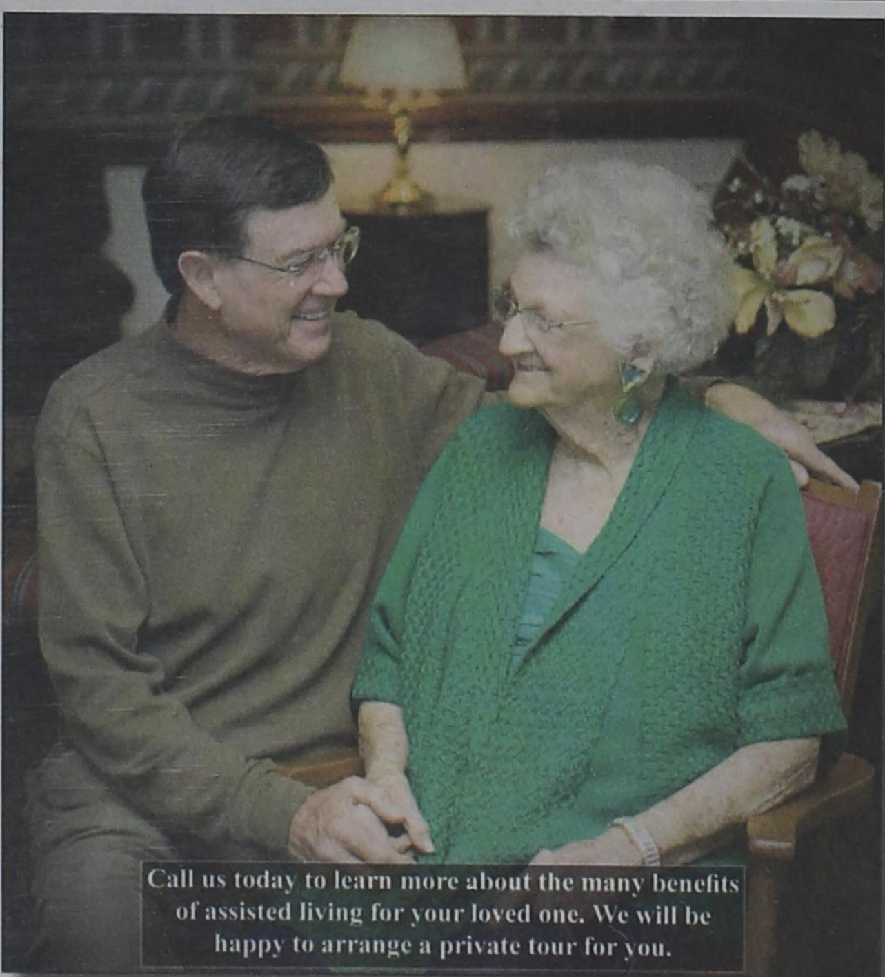
Call us today to learn more about the many benefits of assisted living for your loved one. We will be happy to arrange a private tour for you.