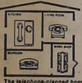
The telephone-planned home has prewired outlets in every important room.

Let us help you plan ahead. Whether you're building, buying or staying put, you'll get the extra convenience you want in a home — when it's telephone-planned. Call our business office — or ask the man on the telephone truck for complete information.