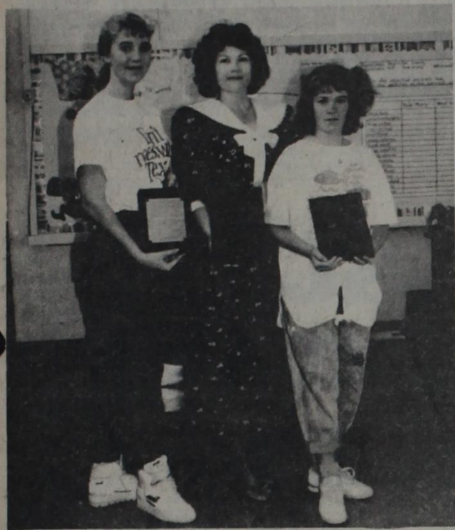
Three individuals from Rising Star Independent School District were honored recently at the Upper Leon Soil and Water Conservation banquet.