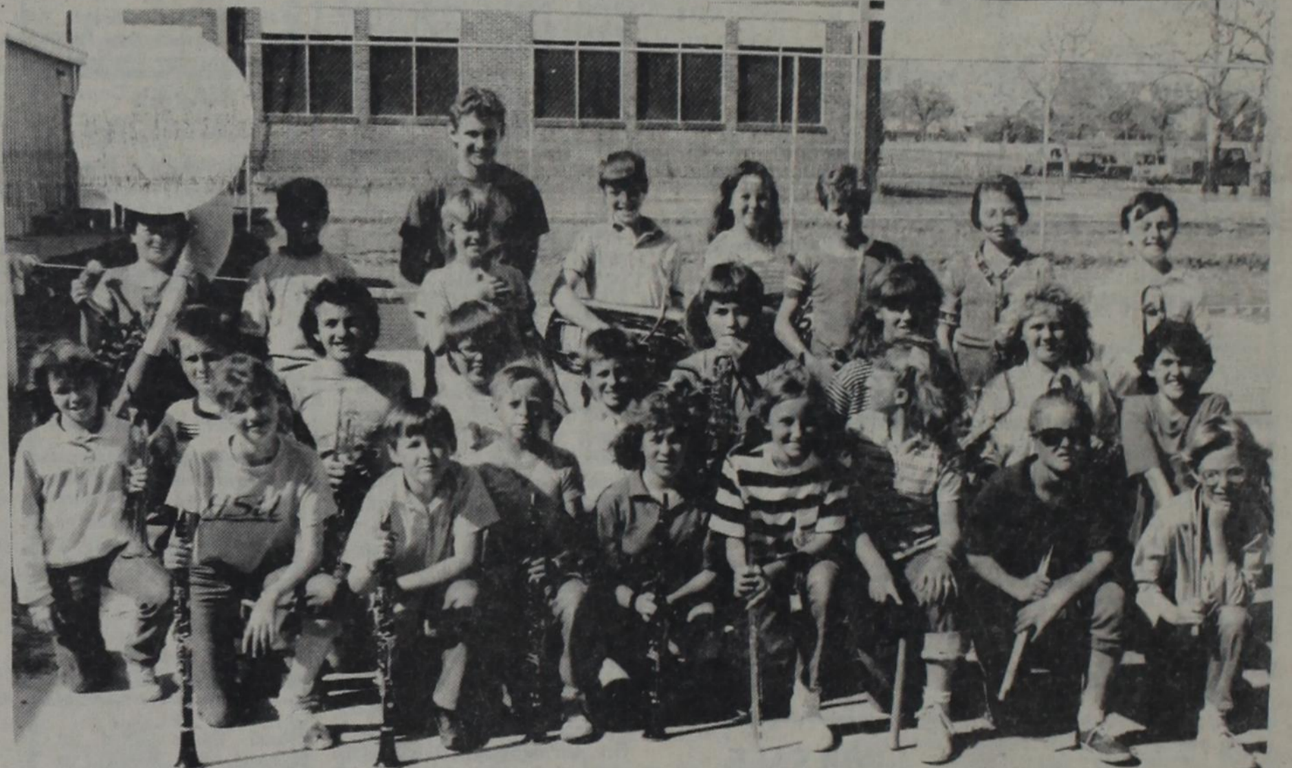
The Rising Star Fifth and Sixth Grade Band attended the Cisco Junior College Band Festival March 25.

could happen if there were no Fire Department to call on. It is a terrible thought, I'll tell you. So let's support our Fire Department. The firefighters have put in endless hours on fires this year and most of the time it is a thankless job, but we really do appreciate you firefighters for taking time from your jobs and families, at times risking your lives to save our homes and places. THANKS!!!!