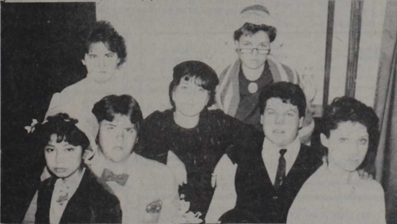
"Dark Brown" is the name of the play and dark brown appears to be the mood of the One-Act Play cast which won at District competition March 22.