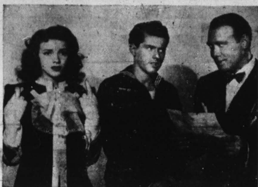
A REAL ENTERTAINMENT JACKPOT is hit by "Take It or Leave It", the New Year's Eve midnight show at the Star. Phil Baker heads the cast.