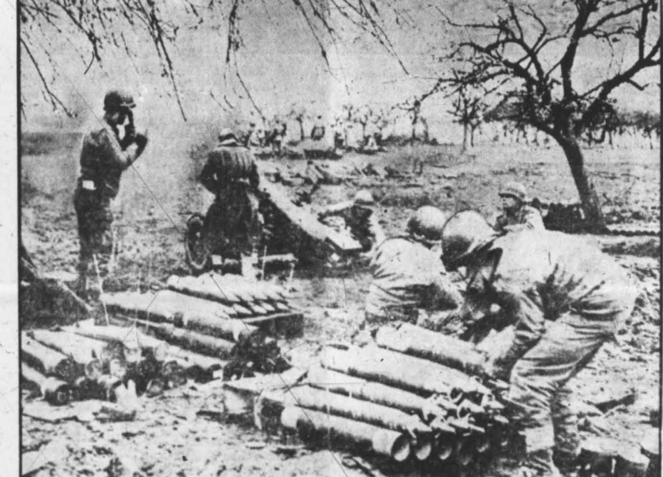
A 105 mm. gun crew in action on the 3rd Army's Saar River front. Fire is directed at German positions beyond the river. Soldier at left maintains communications while his comrades load and fire. It is shells like these that could save so many American lives—if they had enough of them.