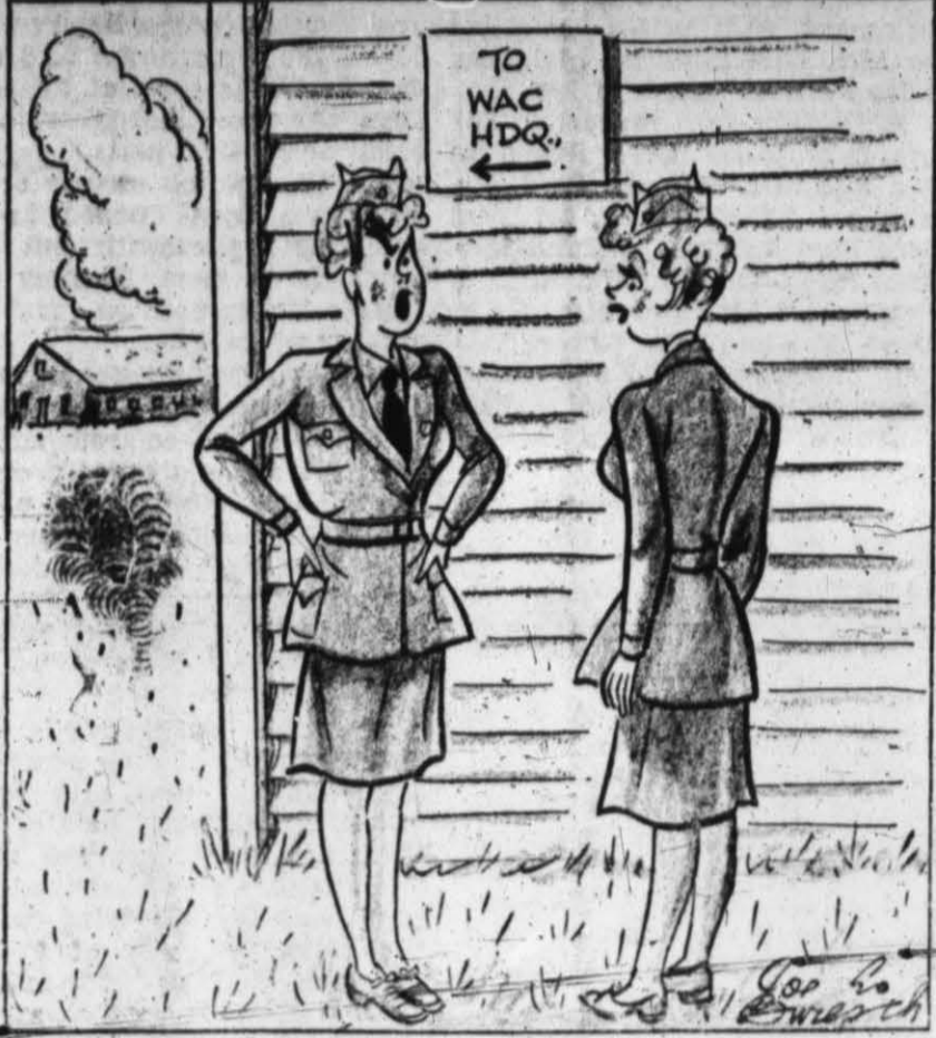
"Nobody told me when I joined that all the girls wore the same outfit!"