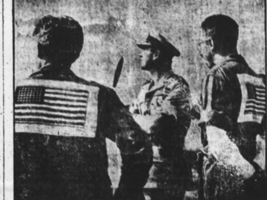
You can easily see that Old Glory is "backing up" these Yank pilots in Burma as they flank Adml. Lord Louis Mountbatten, Allied commander for southeast Asia, while watching aerial maneuvers during his tour of the front.