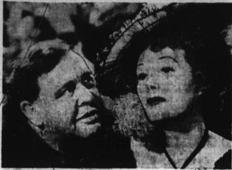
CHARLES LAUGHTON and BINNIE BARNES are teamed in "The Man from Down Under," a story of Australia and two wars. With two romances, a prize fight and the bombing of Northern Australia woven into its plot, there is plenty of story interest as well as a fresh locale. It's the Sunday, Monday and Tuesday show at the Texas.