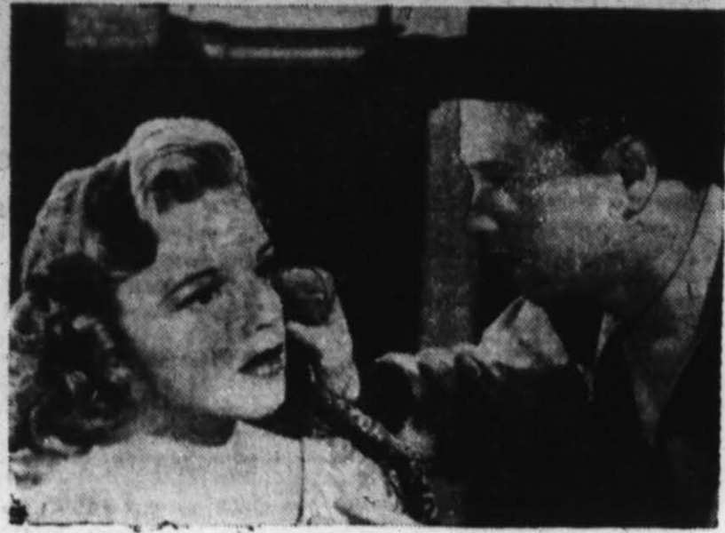
JUDY GARLAND and MICKEY ROONEY provide a graphic picture of what ought to — but seldom does — happen to a successful Broadway musical when it goes through the Hollywood mill. It's George Gershwin's "Girl Crazy" — and as George Gershwin wrote it with the talent of Rooney and Garland to add up to the best film musical of their successful careers. Gershwin tunes include "I've Got Rhythm," "Embraceable You," and "Bidin' My Time." The picture comes to the Star Theatre on Feb. 6, 7 and 8.