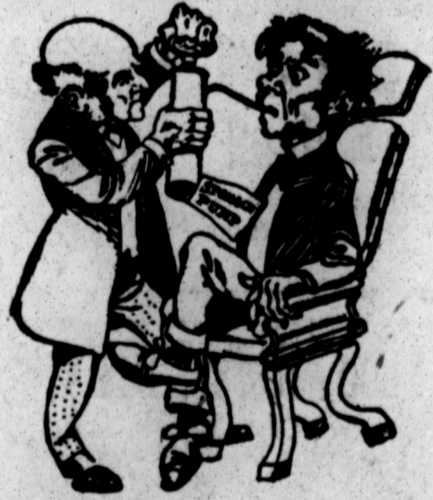
"TAKING HIS MEALS OUT."

Hurried eating has ruined many a man's stomach. The digestion-destroying process is gradual, often unnoticed at first. But it is only a short time until the liver balks, the digestive organs give way, and almost countless ills assail the man who endeavors to economize time at the expense of his health.