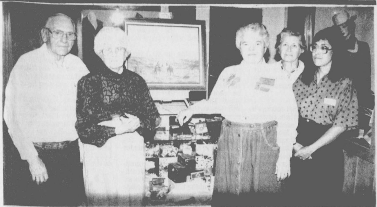
Museum Board members and staff gathered at the Stationmaster's House Museum to welcome visitors to the museum's Open House. The Open House was held Saturday, October 6, from 1-6 p.m. Displayed at the Open House were paintings by local artists, toile paintings, and calendar pictures of the Dion quintuplets dating back to 1938.