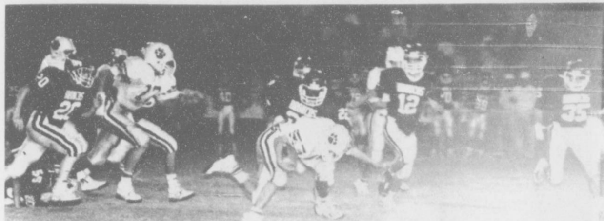
Second quarter kickoff return