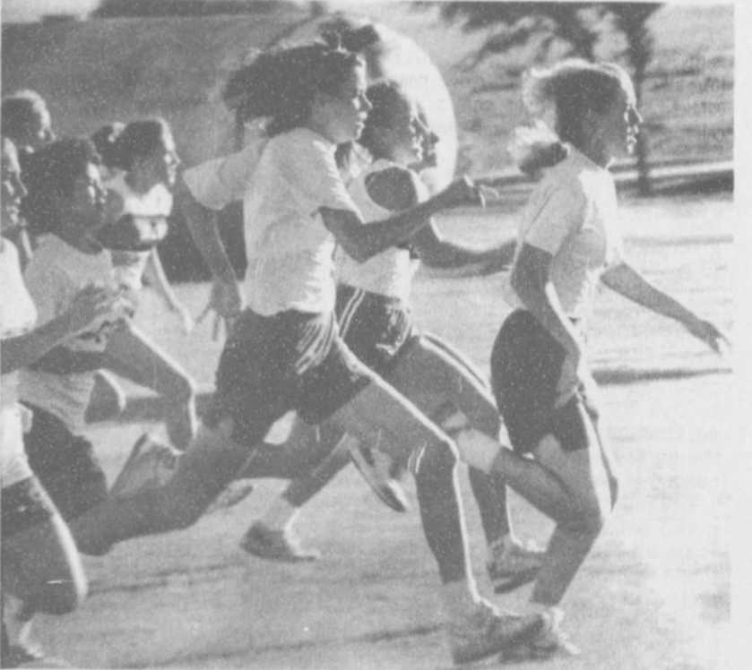
Lady Hounds JV