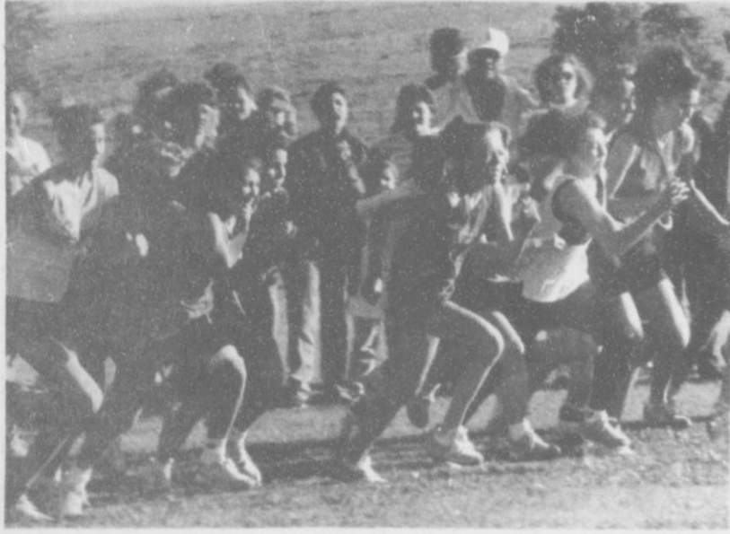
Lady Hounds varsity