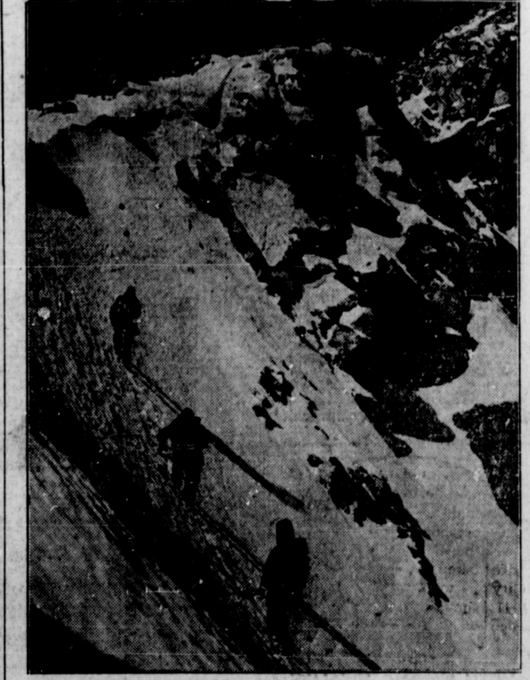
U. S. ARMY'S WINTER WARFARE TRAINING—Uncle Sam's soldiers in reconnaissance parties with skilled instructors are scaling snow-covered mountains and glaciers to determine methods to be used in training troops for Arctic experience. Due to the difficulty in transporting supplies, food and other equipment were dropped to the party by plane. This scene is on a blizzard-swept mountain peak in Colorado during the November.