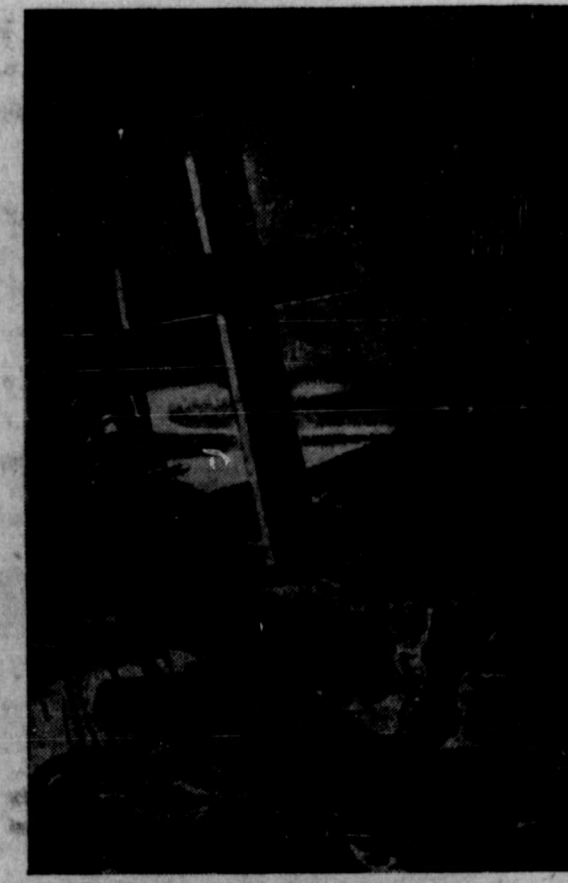
the kid who gave his life for this country? Think that one over before you say, "I can't afford more War Bonds."

THE 4TH WAR LOAN starts next week. Every American will be asked to invest at least $100 in extra War Bonds. At least $100. Better $200, $300, $500. You can afford it.