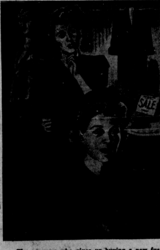
The woman who gives up buying a new fur soat and buys several $100 War Bonds with