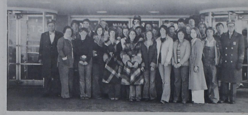
CLARENDON FUTURE TEACHERS ASSOCIATION in Dallas.

extremely proud of his trying for the office and have the spirit that they will do it