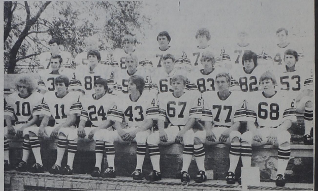
Clarendon High School Varsity Squad 1977-78