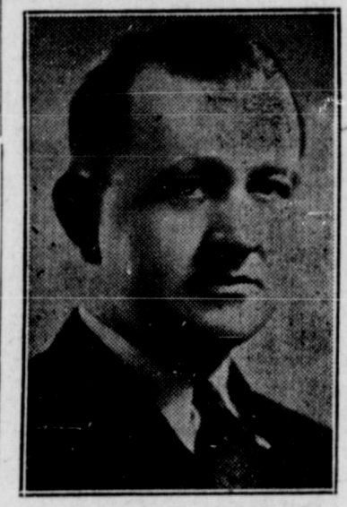
"The Leading Candidate"