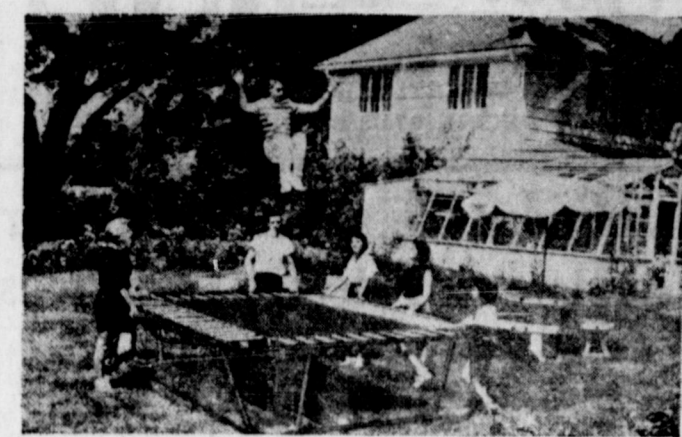
"AMERICAN TRAMPOLINE" ALL SIZES & TYPES FOR YOUR BACK YARD