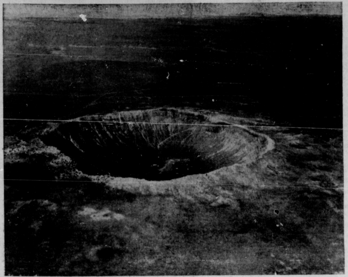
Thousands of years ago a giant meteor flashed across the heavens to plow its way into the earth five miles south of a point on U. S. Highway 66, 29 miles west of Winslow in Northern Arizona. Geologists do not agree on the time but there is no disagreement that the main body of the meteor rests more than 1300 feet below the surface. It has been estimated that more than 400 million tons of rock and earth were displaced when the meteor struck. The crater is 4150 feet in width and 600 feet in depth. Exploration drilling to find the main body of the crater was first started in 1909 and the meteor located in 1932.