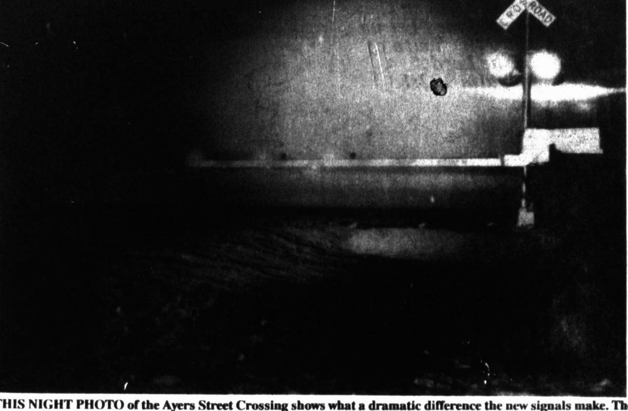
THIS NIGHT PHOTO of the Ayers Street Crossing shows what a dramatic difference the new signals make. The signals appear to be in operation and working properly.