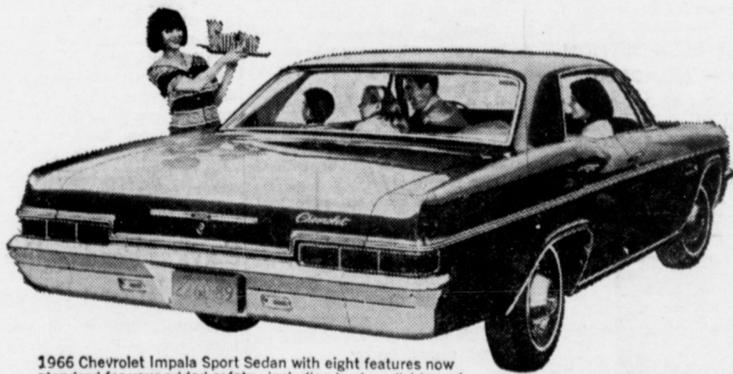
1966 Chevrolet Impala Sport Sedan with eight features now standard for your added safety—including back-up lights and seat belts front and rear (always buckle up!).

What you get is • The meticulous coachwork of Body by Fisher that surrounds you with rich appointments, deep-twist carpeting • Full Coil suspension that uncrinkles roads • Magic-Mirror finish • Gobs of room for hips, legs and feet. What you can add includes • Comfortron automatic heating and air conditioning—spring weather the year round • AM-FM multiplex stereo radio • Tilt-telescopic steering • Power everything—brakes, windows, seats, steering. See your Chevrolet dealer now. You'll never find a better time to buy, so Whatayawaitinfor? Big-saving summer buys on Chevrolet, Chevelle, Chevy II and Corvair.