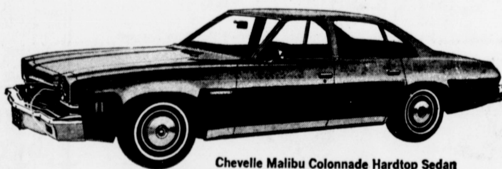
Chevelle Malibu Colonnade Hardtop Sedan

Drive It BEFORE YOU BUY Any Other intermediate Sized Car! Alderson Chevrolet