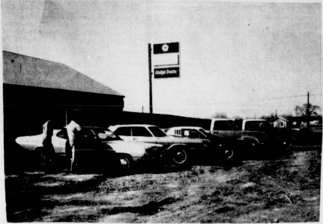
This is the lineup of Dodge and Plymouth Cars and Pickups received this week by Mills Motors, Inc., located on the Brice Highway south. J. C. Mills is pictured showing a new Dodge Dart to a customer and reported a number of additional units in Chrysler, Dodge and Plymouth were due in later this week. Staff Photo