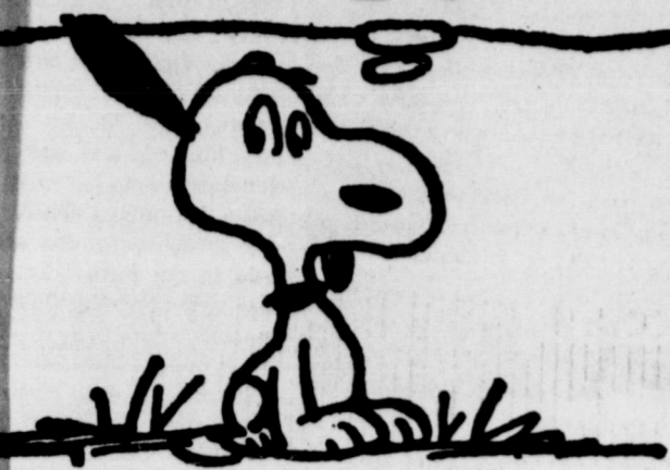
by The Snoopy