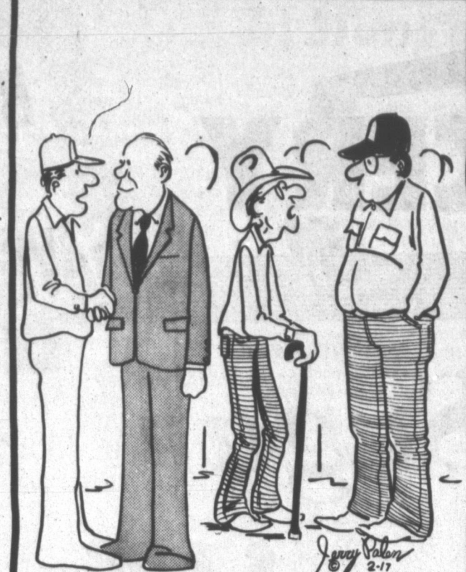
"What did he say about farmers full of gas?"