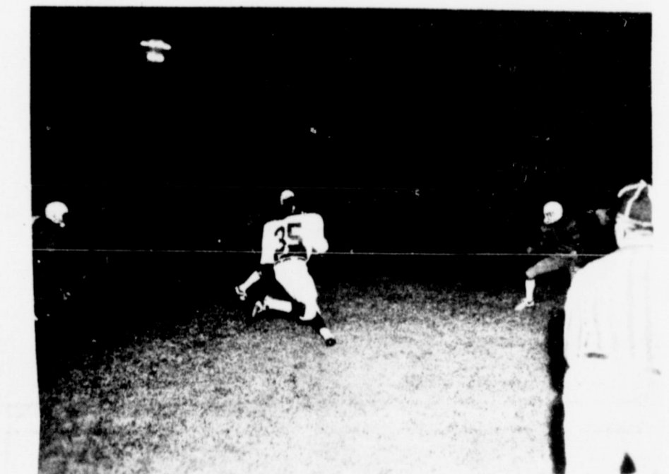
Bronc heading for paydirt to help win final game of regular season.