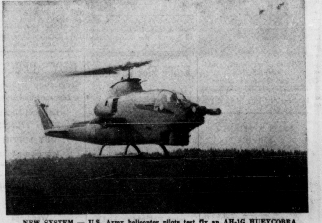
NEW SYSTEM — U.S. Army helicopter pilots test fly an AH-1G HUEYCOBRA equipped with the experimental Cobra Night Fire Control System (CONFICS). The new system, being tested at Ft. Rucker, Ala., by the U.S. Army Aviation Test Board, makes use of a low-light level television camera mounted on the turret and controlled by the XM28 sighting system.