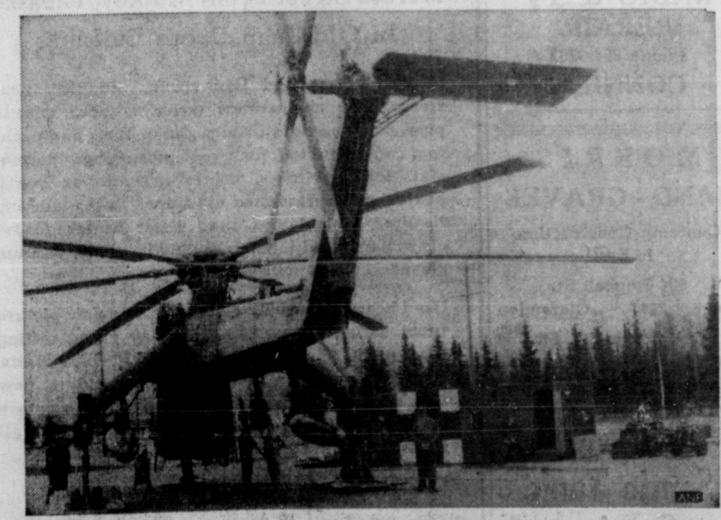
ARCTIC MEDIPOD—A CH-54B SIKORSKY "Flying Crane" waits on a runway at Ft. Wainwright prior to a flight to Dillingham, Alaska. The U.S. Army, Alaska, now has two "Flying Cranes" equipped with boxlike medipods. Fully staffed, the completely air-mobile medipod dispensary provides medical, dental and optometry service to soldiers in the field as well as to Alaskan natives in outlying villages.