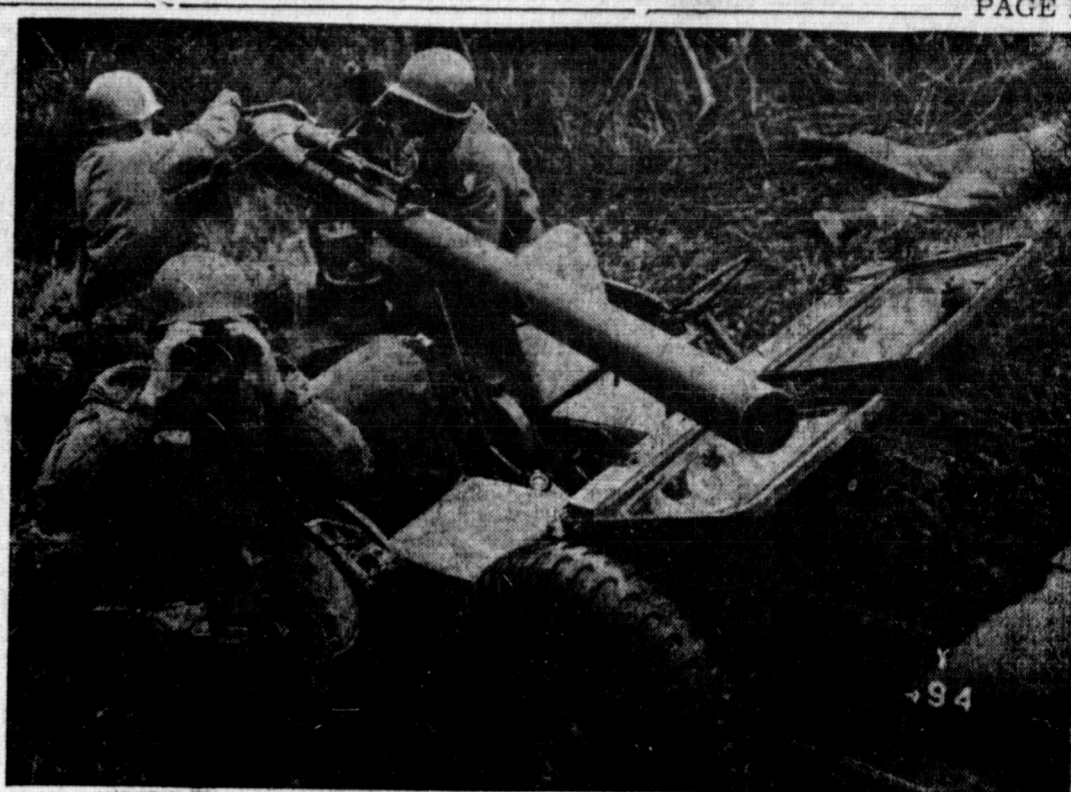
INFANTRY'S ARTILLERY—Men of the Eighth Infantry Division move their jeep-mounted 100mm recoilless rifle into an assault position during Army maneuvers in Germany. This weapon is a far cry from the towed 37mm and 57mm tank guns of World War II.