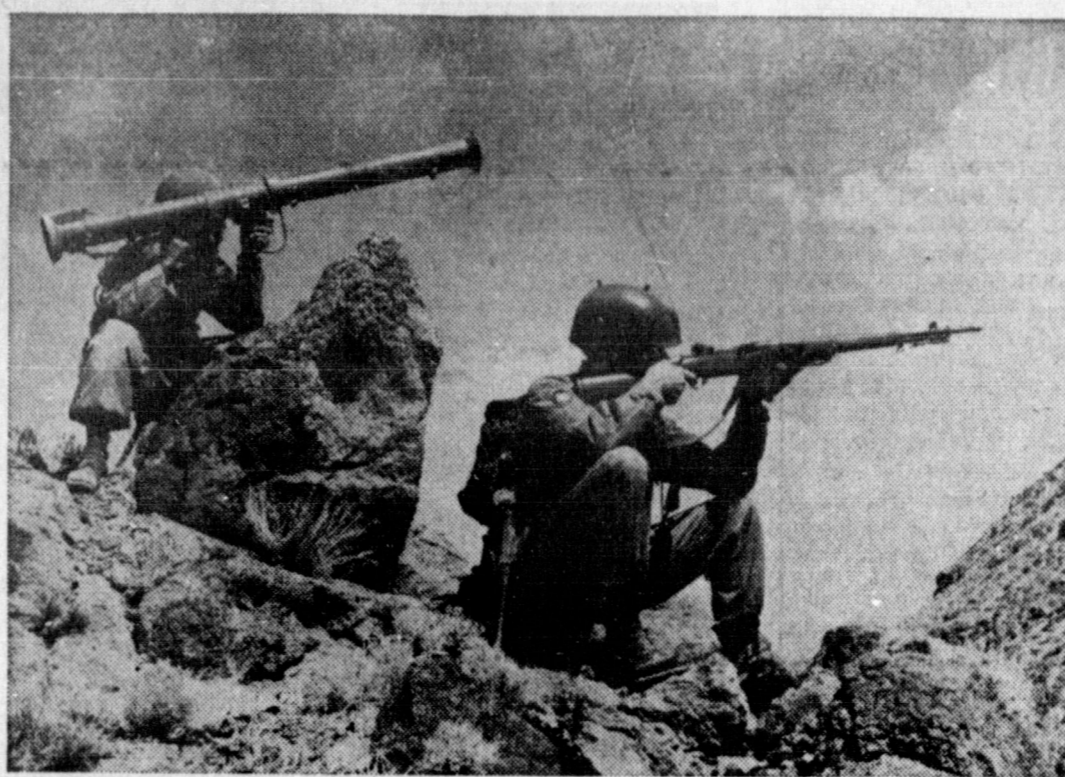
SILHOUETTED against the desert sky, two STRAC troopers of the U.S. Army's 101st Airborne Division pick out targets as the unit moves to attack their objective during the assault phase of "Operation Utah Eagle I," an air-mobility and tactical assault exercise held in the Utah-Nevada desert country. Note helmet radio worn by soldier at right.