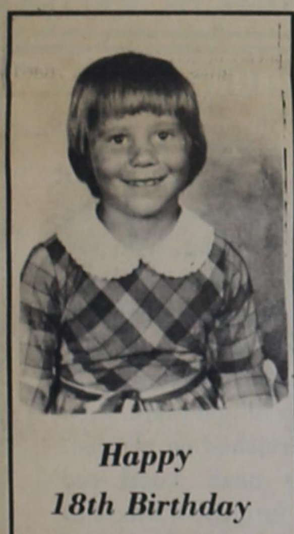
Happy 18th Birthday