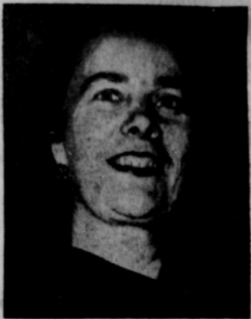
NAMED TO UN... Mrs. Oswald B. Lord was chosen by Pres. Eisenhower to take place of Mrs. Eleanor Roosevelt on UN commission on human rights.