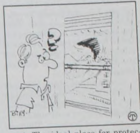
4. The ideal place for protection from a tornado at home is: (a) your garage, inside a parked car (b) in a closet or laundry room (c) in the lowest level (basement if you have one) and under some-thing sturdy like a heavy work