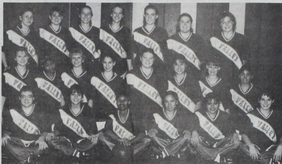
1996 LADY PATRIOTS