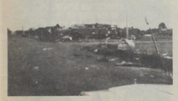
The above picture shows what was left of the new school building at Matador after it was hit by a tornado Tuesday evening. There were approximately 15 people in the basement here with no injuries reported.