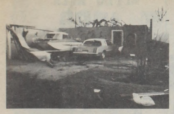
In the picture above, a home was destroyed and the car in the foreground had lumber laid on it just as if it had been stacked through the windows.