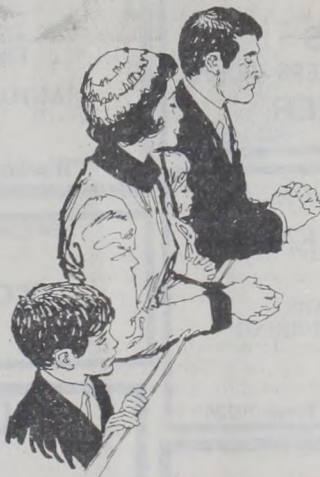
Scriptures selected by The American Bible Society

In church our efforts to communicate with Him are strengthened by the fact that many others are praying with us. They need Him just as much as we do. And we need their longings, their hopes and wishes and feelings to help us express our own. Join us in prayer at your local church or synagogue.