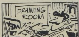
The term drawing room is a shortening of the word withdrawing, for the room to which guests withdrew.