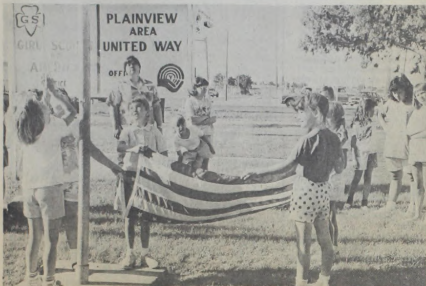
Opening Day ceremonies at Brownie Day Camp at Plainview.