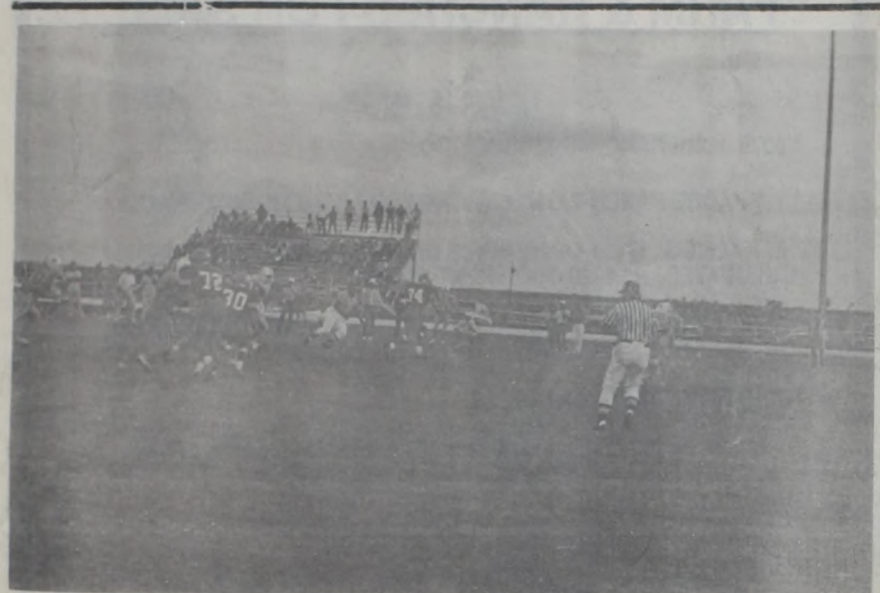
Patriots earn win over Miami.