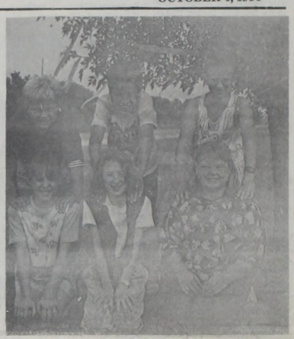
Valley Students show their support of U. S. troops by tying yellow bows in trees at Valley School.

Any ideas, suggestions, materials, funds, or help will be considered. If you would like to be involved in this worthwhile endeavor, call any member of We The Women for more information