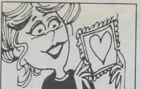
The first commercial valentines were made in the early 1800s.

LOST: MALE BLACK & WHITE Border Collie Puppy (4 months old). Has a brown leather collar w/one blue & one silver tag from Odessa, Texas. Please call (915) 550-4617, (806) 823-2470 or (806) 823-2131, ext. 12. Good Reward! 33 1tp