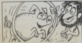
Scientists believe that people began taming hogs about 8,000 years ago, during the Stone Age.