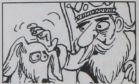
King Arthur's dog, legend says, was named Cavall.