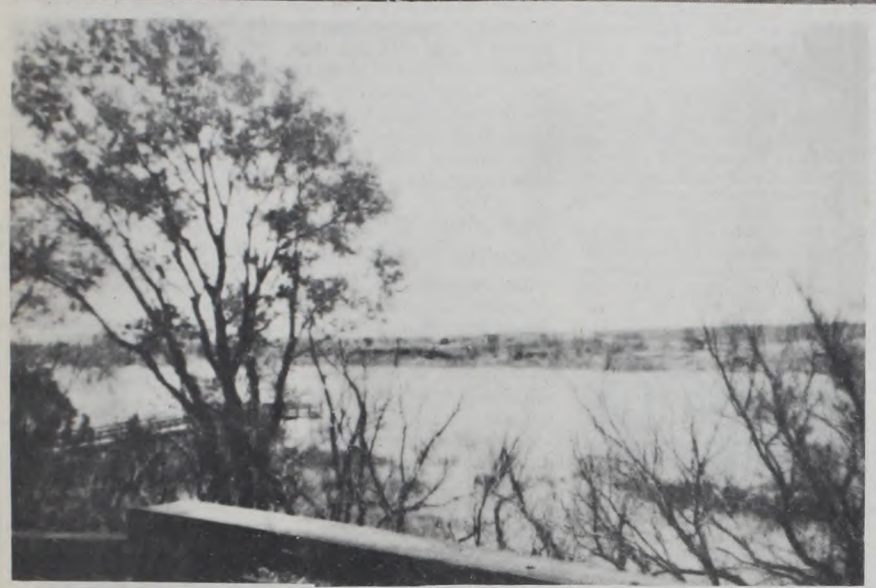
Lake Theo at Caprock Canyons State Park is at its highest level in several years after receiving 5.7