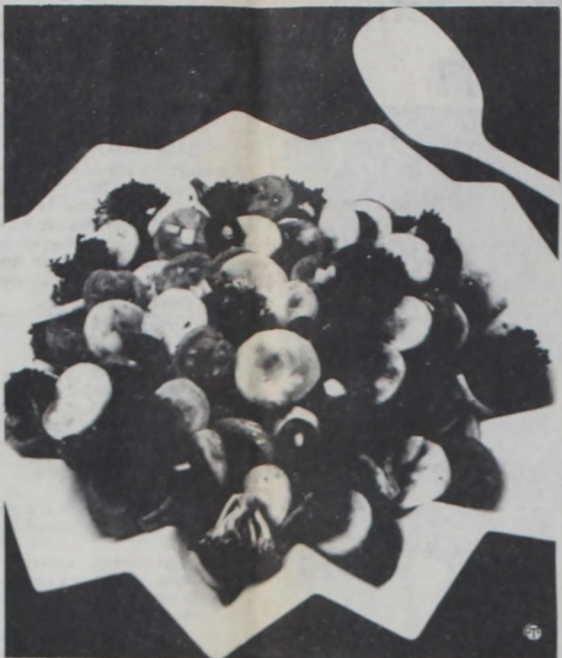
When the heat's on, cool off with delicious, low-calorie Vegetable Festival Salad made in minutes with V8 vegetable juice.

If the last thing you want to be doing in the summer is cooking in the kitchen, stay in the kitchen but don't cook. Create a crisp, cool eye-opening salad using healthy, tangy "V8" vegetable juice. Salads made with "V8" are not only delicious and refreshing, they're low in calories, too. Vegetable Festival Salad, with its colorful summertime medley of broccoli, cherry tomatoes and yellow squash will awaken even the most sagging summer appetites. The dressing of vegetable juice, chopped onion, oil, vinegar and basil tastes delicious and at only 72 calories per serving, it is almost too good to be true!