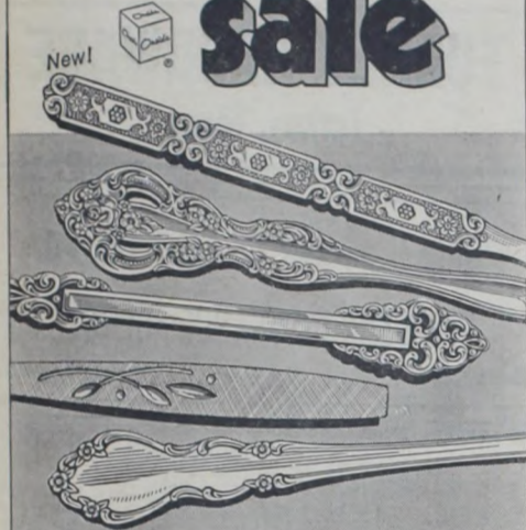
Patterns, top to bottom: Raphael*, Michelangelo*, Rembrandt*, Will 'O' Wisp*, Dover*.

PLACE SETTING SALE ENDS Nov. 18, 1972 sale