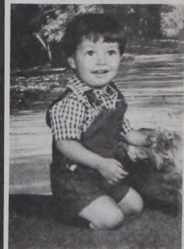
YOU'RE STILL JUST AS CUTE!