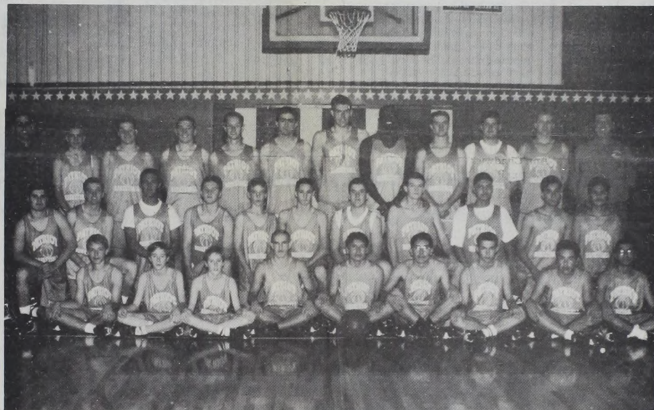
1996 VALLEY PATRIOTS