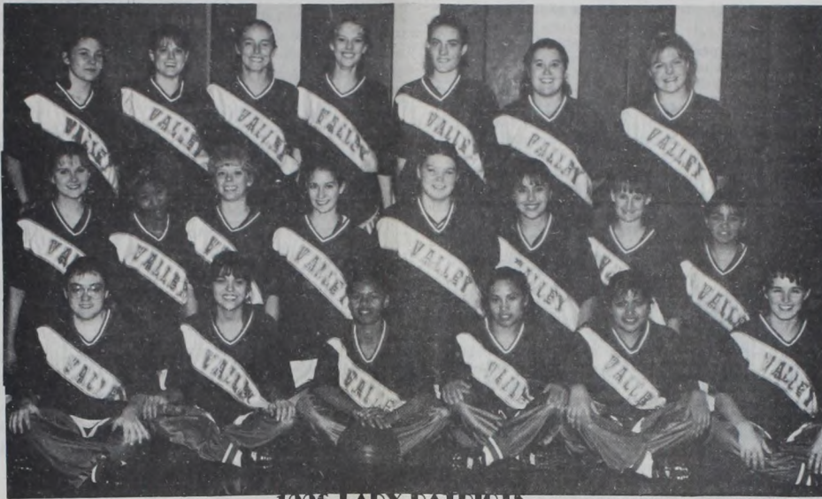
1996 LADY PATRIOTS