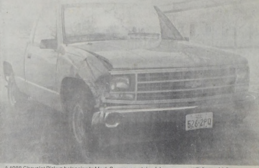
A 1988 Chevolet Pickup belonging to Mack Seymour sustained damages recently from a hit & run accident. The auto was parked in front of the Seymour home when the incident occurred.

aid us in programs to make our city more appealing to the investor and tourist.