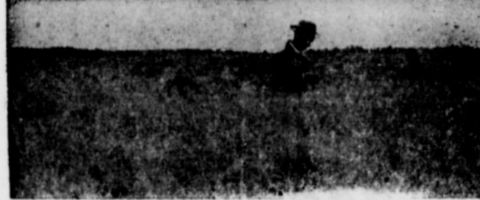
These photos show various stages of brush control on the B. B. Hickman ranch near Rising Star. Photo No. 1 shows post oak brush land which has had no treatment. Extreme density of the brush can be noted. There is practically no grass on the land. Photo No. 2 shows an adjoining pasture where the brush has been pushed with a bulldozer and then "shredded" with a brush cutter. Photo No. 3 shows another adjoining pasture which has had the pushing and cutting treatment, and then was sown with Blue Panic grass. Excellent cover can be noted. John Lee, work unit conservationist for the Soil Conservation Service at Rising Star is shown in the photos.