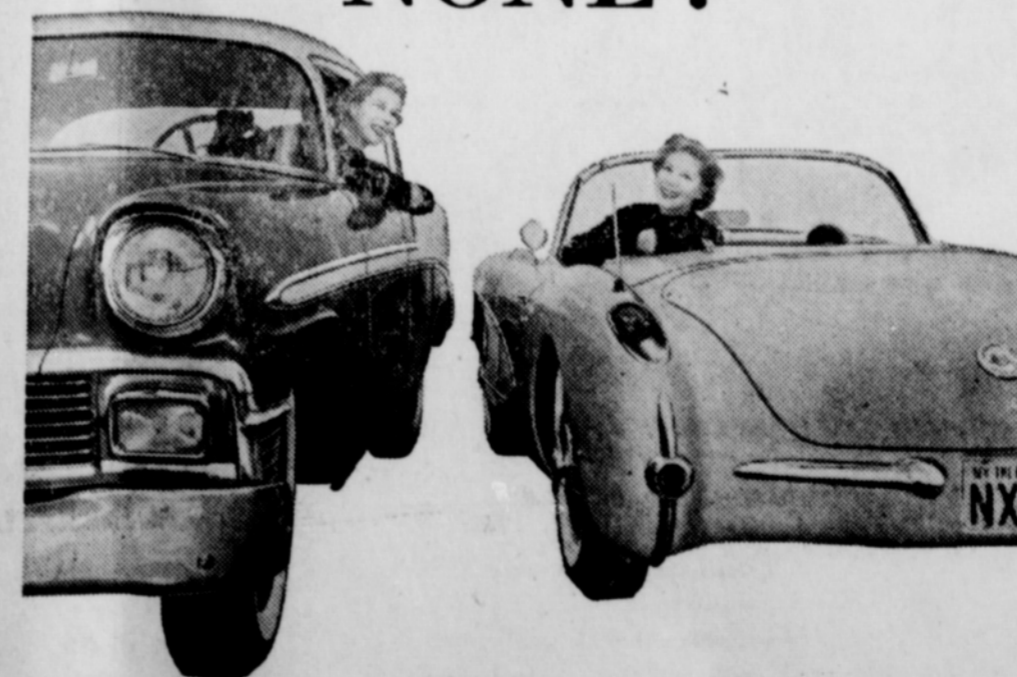
Chevrolet's own Dinah Shore seen on NBC Television every Tuesday and Thursday