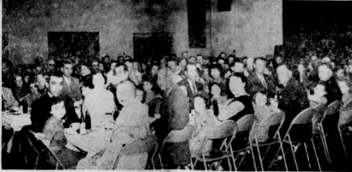
A highlight of the year for Girl and Brownie Scouts of Baird is the annual Father-Daughter Banquet, held in the school Cafeteria. Pictured here is a scene from the recent function which was attended by a record number.