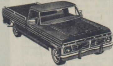
FORD EXPLORER SPECIAL. Now, get up to $201 off on limited edition Ford Explorer pickups, specially equipped with air conditioning, tinted glass, automatic transmission, power steering, and more. One tough truck—at a hard-to-beat price!