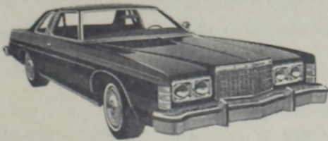
FORD LTD. Smooth-riding, quiet, luxurious. Plenty of room for six adults. And with its optional trailering equipment, LTD is rated to tow a half ton more than its biggest competitor.

Our business is good... and it's gonna' get better! Because we're stocking up our showrooms, and tuning up our trade-in offers to give you the value you want. Small, mid-size, family-size Fords—wagons in all sizes, plus the pick of the pickups—they're all here and ready to roll. Join us at our big Bicentennial Fling—today!