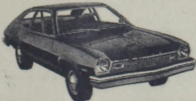
FORD PINTO. America's best-selling small car. Packs a bigger engine, wider stance and more road-hugging weight than the leading imports. Yet it's still sticker-priced less than many imports.