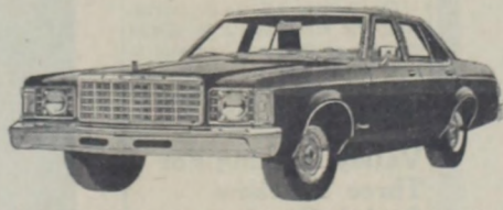
FORD GRANADA. The classic look of Cadillac Seville—at a sticker price close to the VW Rabbit. No wonder Ford Granada is the best-selling sedan in the country.