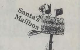
Santa Letters Welcomed At Valley Tribune Office