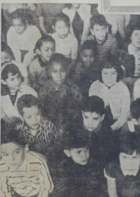
Kids... that's what PTA is all about. It began 75 years ago in February, 1897, when founders Alice McLellan Birney and Phoebe Apperson Hearst recognized the need for improving the conditions affecting children and youth. Since that time, the National PTA has been instrumental in activities ranging from the establishment of hot lunch programs to lobbying for the passage of the recently enacted Drug Abuse Education Act. PTA believes that if a single child is lost, a part of the nation is also lost. As in 1897, PTA continues to help parents, teachers and students provide a better life for children growing up in modern America.