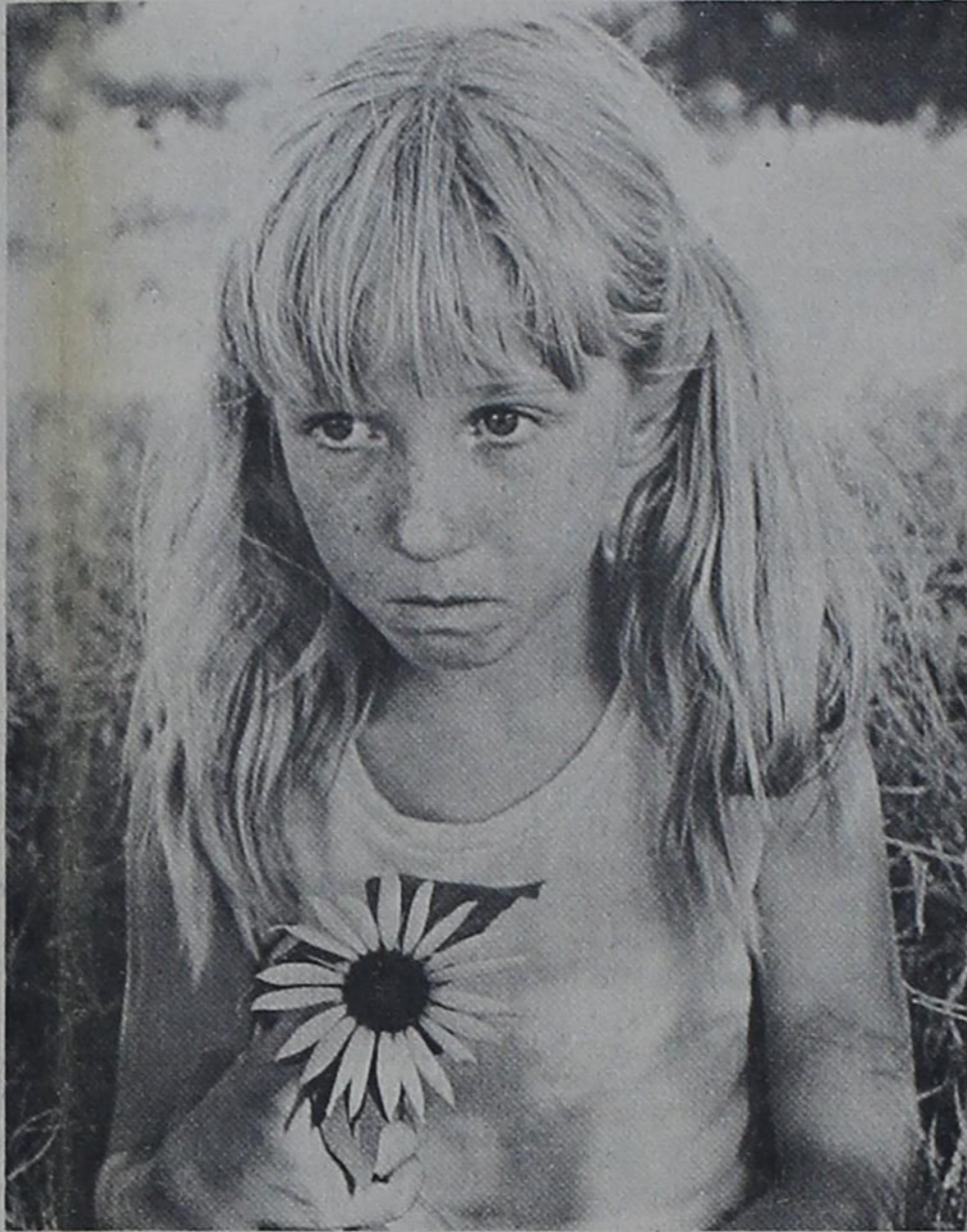
He loves me-he loves me not She loves me-she loves me not . . . .