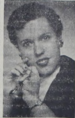
Young Couple Is Wed In Pretty Ceremony