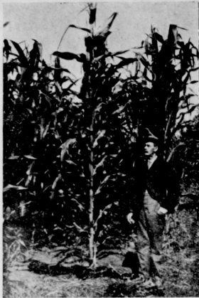
CAN WE RAISE CORN?