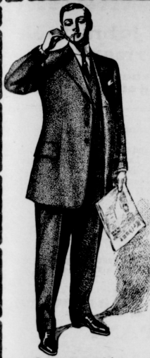
Copyright 1908 by Hart Schaffner & Marx